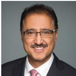
Amarjeet Sohi Canada's Minister of Natural Resources

Elected three times as an Edmonton City Councillor, the Honourable Amarjeet Sohi was elected the Member of Parliament for Edmonton Mill Woods in 2015.